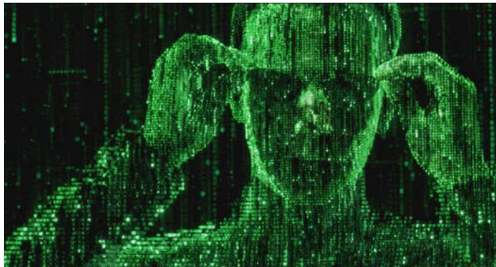
Mind Trip Intel wants into your brain Warner Bros.

By Jeremy Hsu Posted 11.20.2009 at 3:00 pm